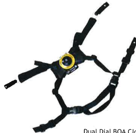
Dual Dial BOA Closure System

Contains no proprietary or export-controlled data.